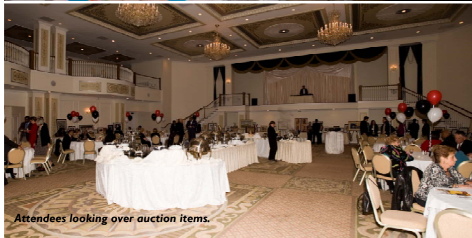
Attendees looking over auction items.