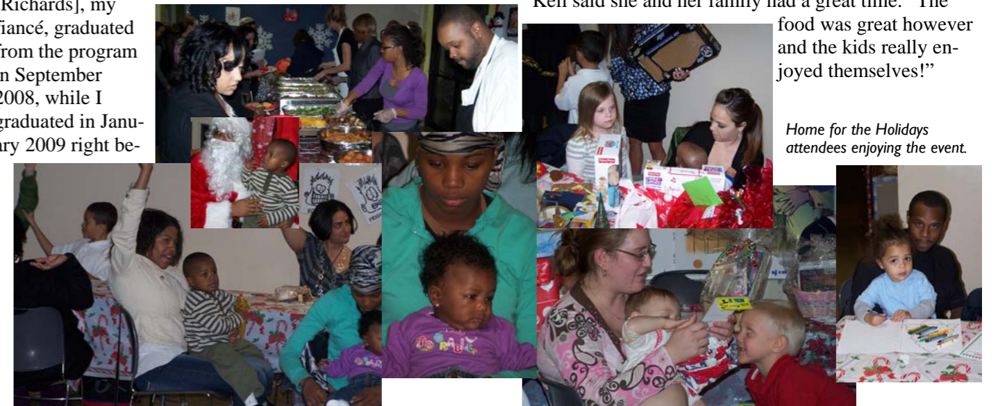
Home for the Holidays attendees enjoying the event.